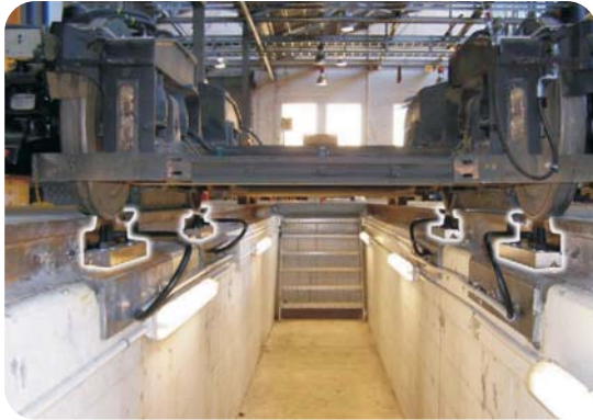
Trakmate 1 in-line loadcells

Trakmate is a new and unique concept design for the weighing and balancing of any type of rail vehicle. It is the real solution for weighing and balancing in all manufacturing, rail maintenance workshops or other suited applications.