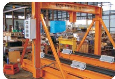
Bogie balancing press fitted with Trakmate loadcells