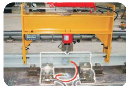
Trakmate test press is used for on-site calibration - no test train required