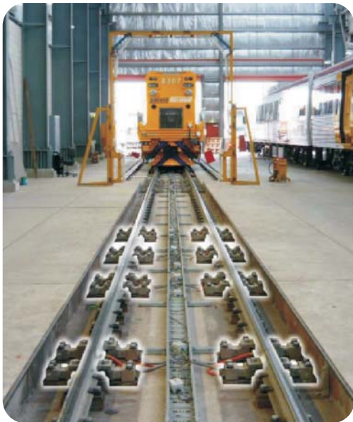
Trakmate 2 loadcells under rails