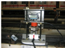
Test Press for On Site Calibration