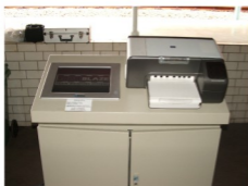
Control Cabinet with Printer